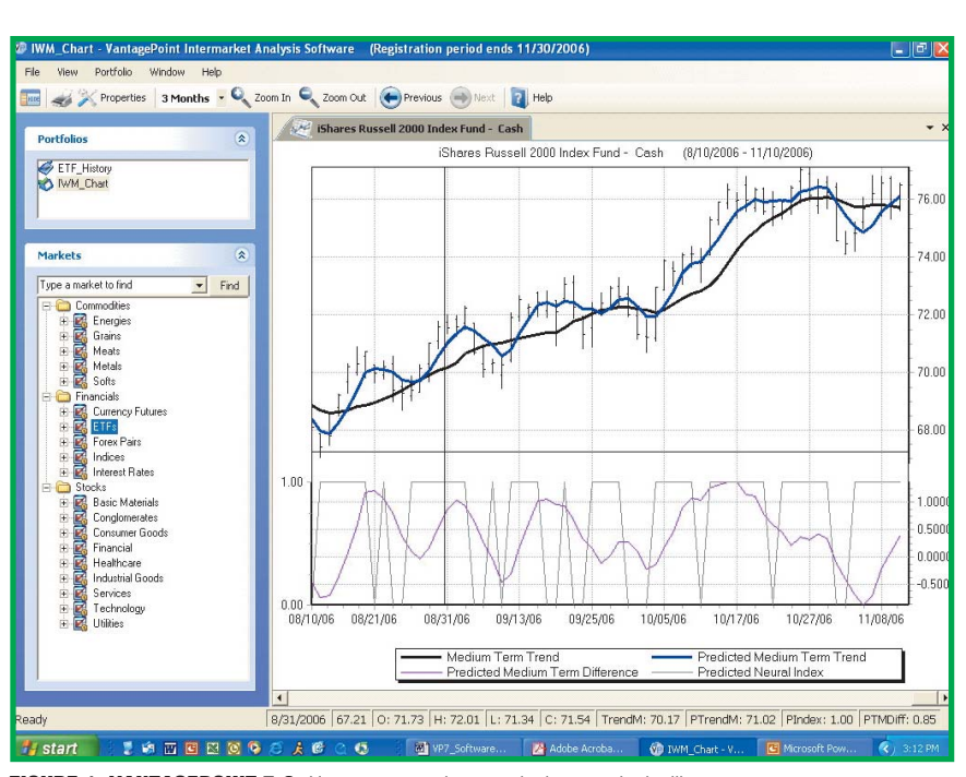
FIGURE 1: VANTAGEPOINT 7.0. Here you see what a typical screen looks like.

Strategy 1 is simple, involving only the neural index and predicted strength